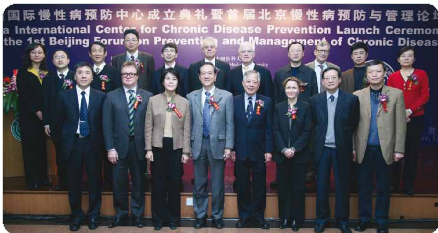
Senior delegates at the inaugural Beijing Forum on Chronic Disease